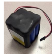
Back-Up Battery (BP11V06AH)