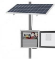
Solar 20 Kit