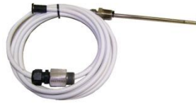
Shielded RTD Cable